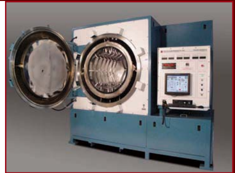
Above: The Pacer 18/30-13 with computer control package

For furnaces with up to 24" x 24" x 48" work zones, ask about our Performer and Heat Treat Series.