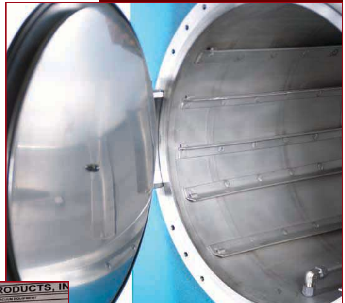
Shown above is the V/IG all stainless steel chamber interior configured for multiple shelving units.