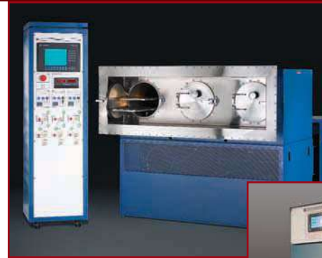
Shown above and at right: V/IG multi-oven station and V/IG single oven station.

The TM Vacuum V/IG Oven Series features several standard models with many options available, making it simple to control your process and its cost.