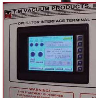
Shown left: Color touch panel allows control of all system functions and parameters.